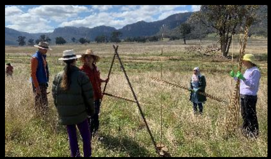
Leanne Thompson Draw the Line 2020 grass, jute, bamboo, participation 50 x 10 x 2m

from Land Studio and Capertee Weaving Water Project, Umbiella, Glen Alice NSW Mapping contour and harvesting material (preparation of installation site for land sculpture) September 2020